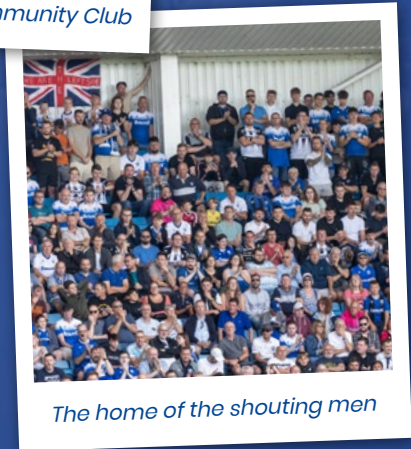
The home of the shouting men