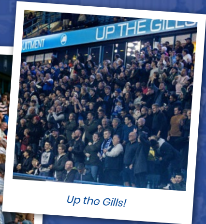
Up the Gills!