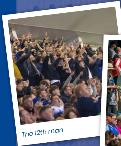
The 12th man